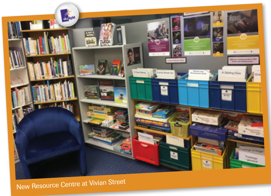
New Resource Centre at Vivian Street